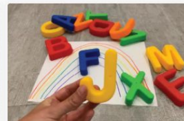
Rainbow Letter Board