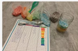
Preschool Temperature Chart