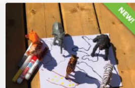
Shadow Drawing for Kids