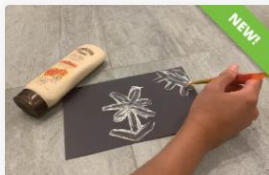
Sunscreen Painting - Science Experiment