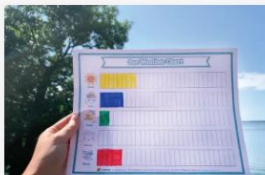
Weather Chart Graph for Preschool