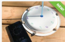
Making a Paper Plate Sundial